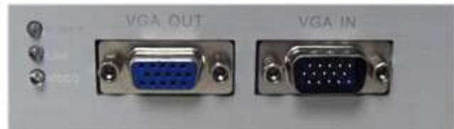
Rear of sender