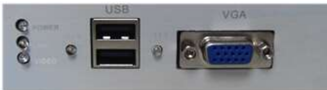
Front of receiver