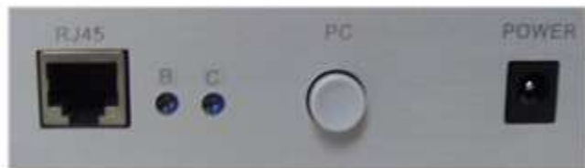
Rear of receiver