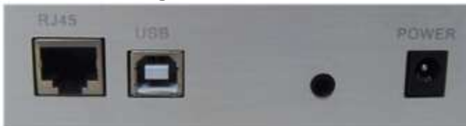
Front of sender